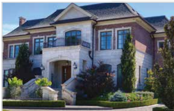
Mix the the smooth and clean look of Vanderbilt with other building materials.