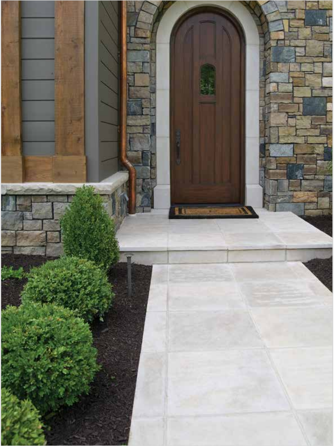
24" x 24" Standard size pavers.