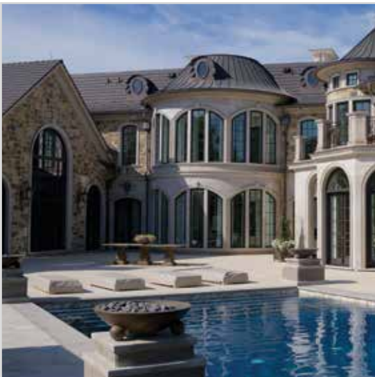
Custom pool coping and window trim.