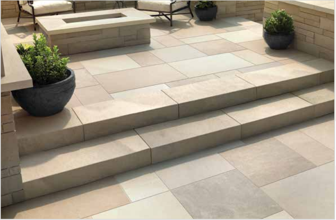
Highpoint paver pattern.