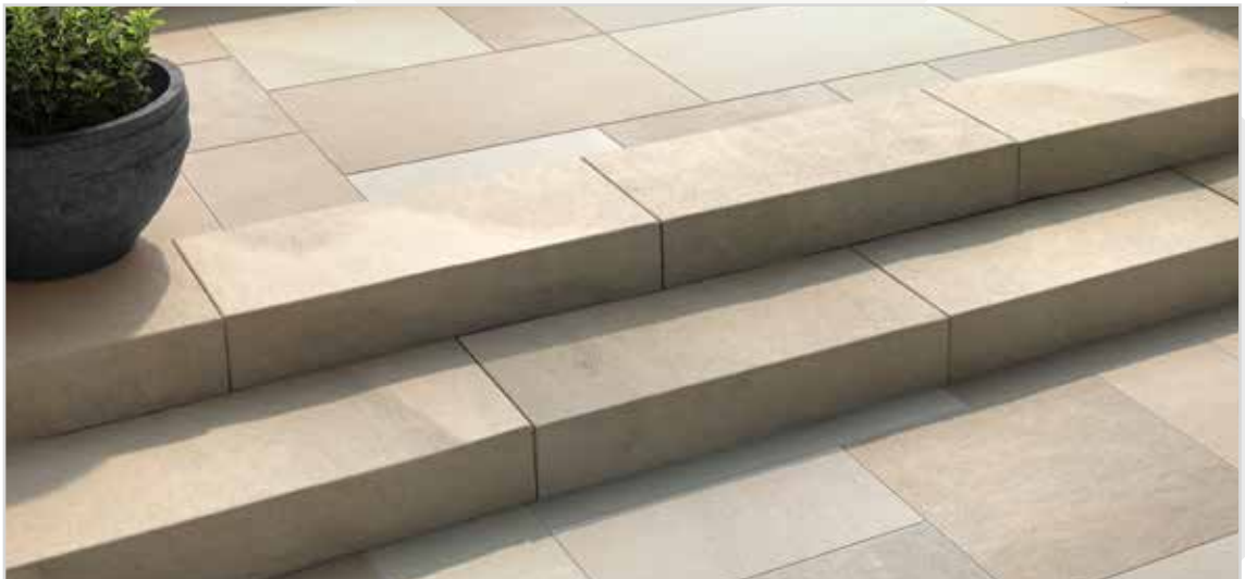
Garden steppers with Highpoint paver pattern.