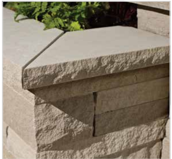
Rock face wall cap.