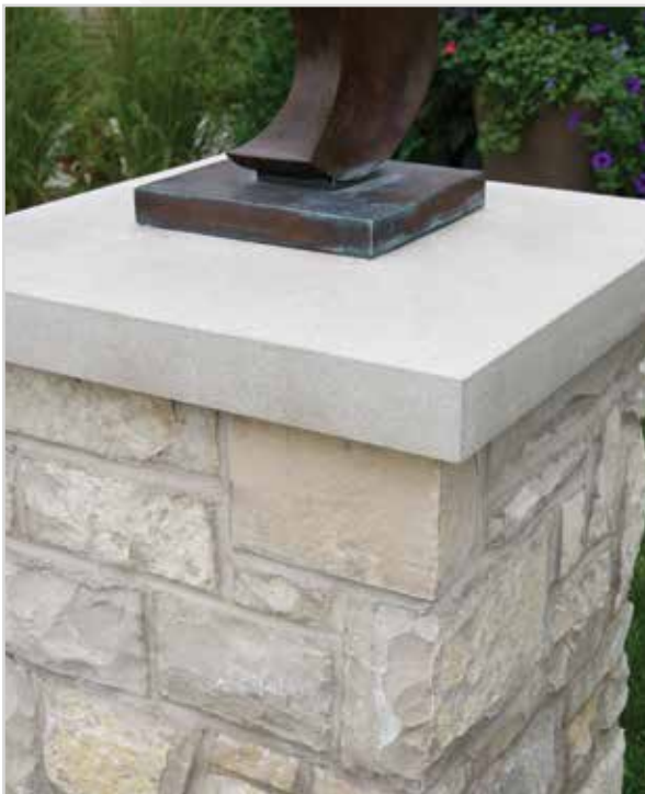
Square edge pier cap.