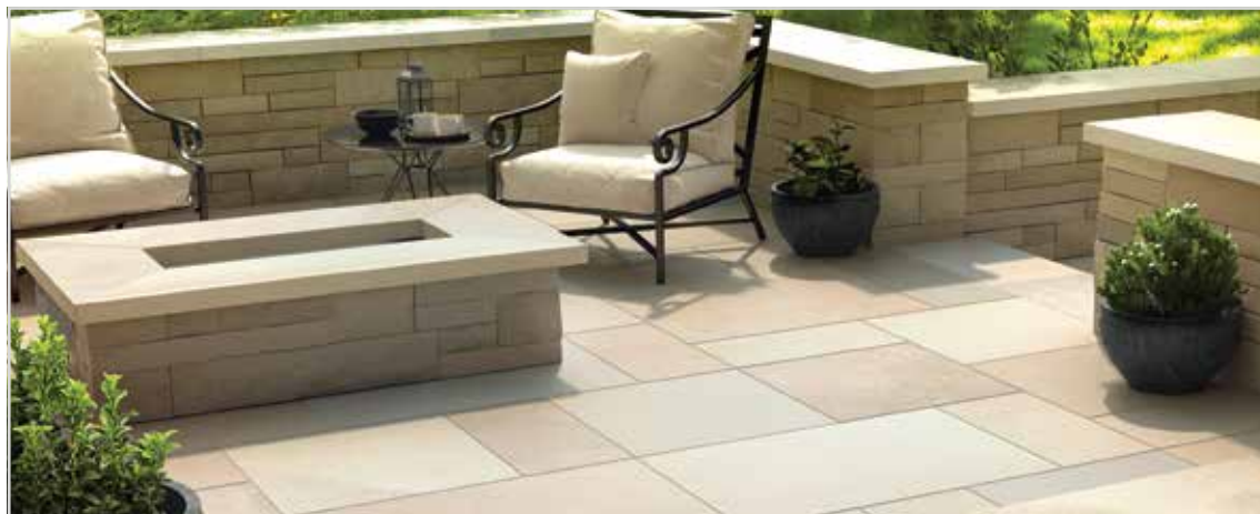
Highpoint paver pattern.