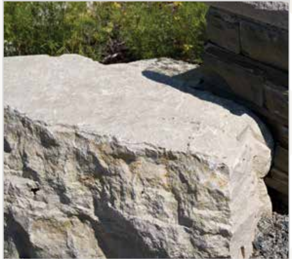
Large sized boulder.

Indiana Limestone boulders are natural stone from our quarries, and vary as a natural material. While images are representative we cannot guarantee that boulders feature weathering, moss elements, quarry drill marks, etc.