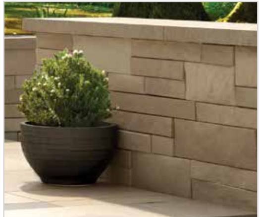
3" and 6" ashlar pattern for a more dynamic look.

Dry stack designs should only be used in limited and non-retaining applications. Walls, excluding caps, should not exceed 2 feet in a single width. Larger heights can be designed if multiple interlocking widths of product are used. If using caps on a single depth wall, it is recommended to use mortar to set the cap for stability. Designs should be completed or reviewed by a landscape professional or mason prior to construction.