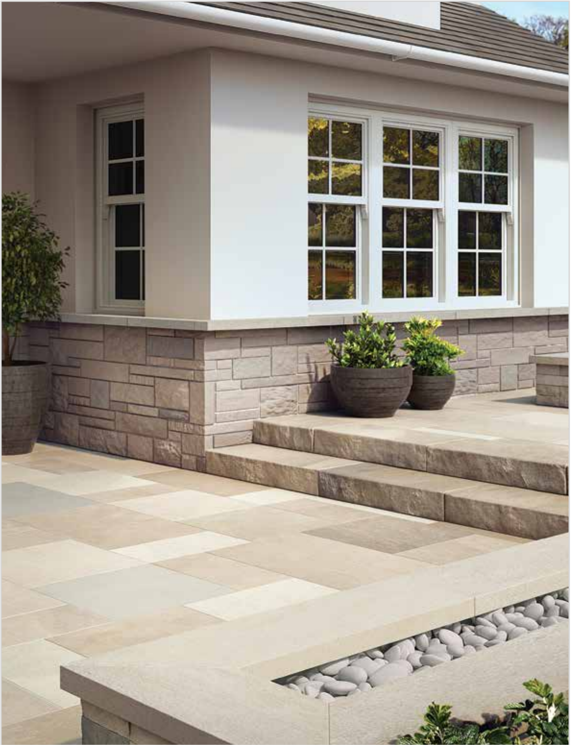
Highpoint paver pattern, 3" and 6" garden wall in ashlar pattern, sills used as wall caps. Estate Veneer Series Berkshire cladding on home.