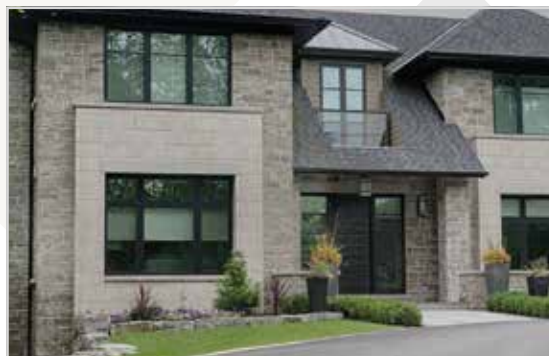
Vanderbilt veneer shown in running bond pattern to accent lower windows.