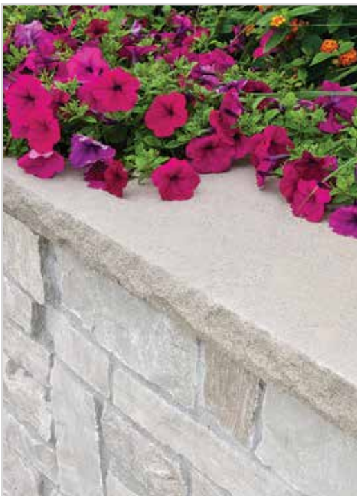
Rock face wall cap.