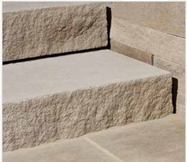
Garden stepper: Split front, back, and ends with sawn top and bottom.

Garden Steppers lend a sense of weight and permanence by creating step elements from single pieces of Indiana Limestone. Our steppers add an inviting touch to any landscaping area.