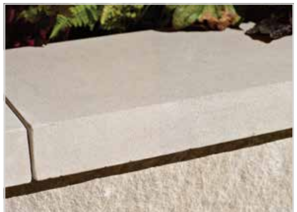
Sill used as a smooth edge wall cap.