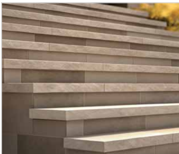
Vanderbilt thin veneer with treads.