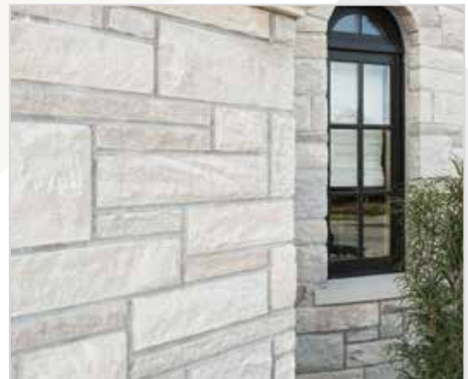
Ashlar pattern shown in four course heights.