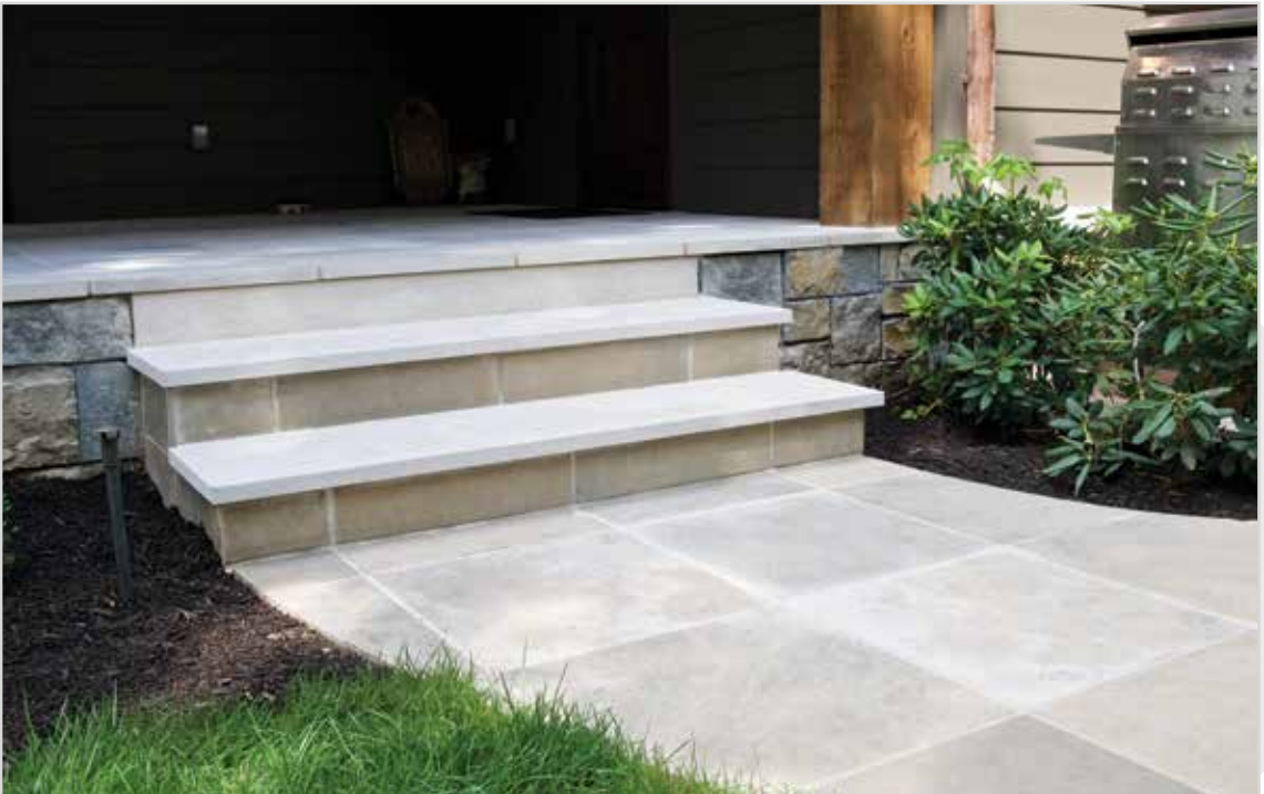
24" x 24" Standard size pavers.