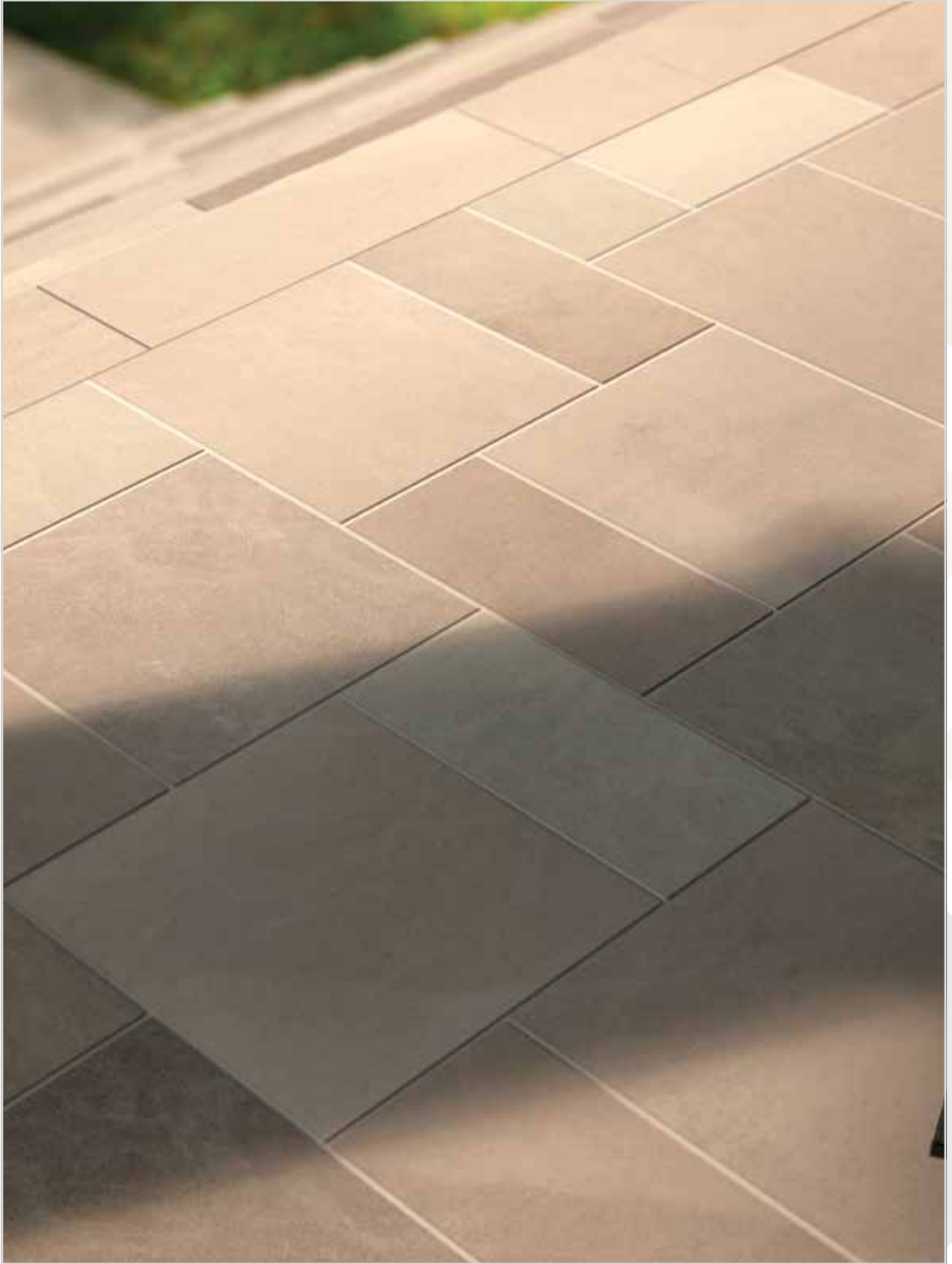
Modesto paver pattern.