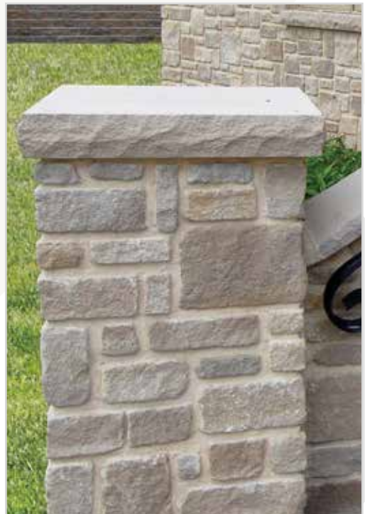
Rock face pier cap.