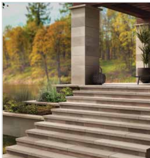
Treads and Vanderbilt thin veneer columns.