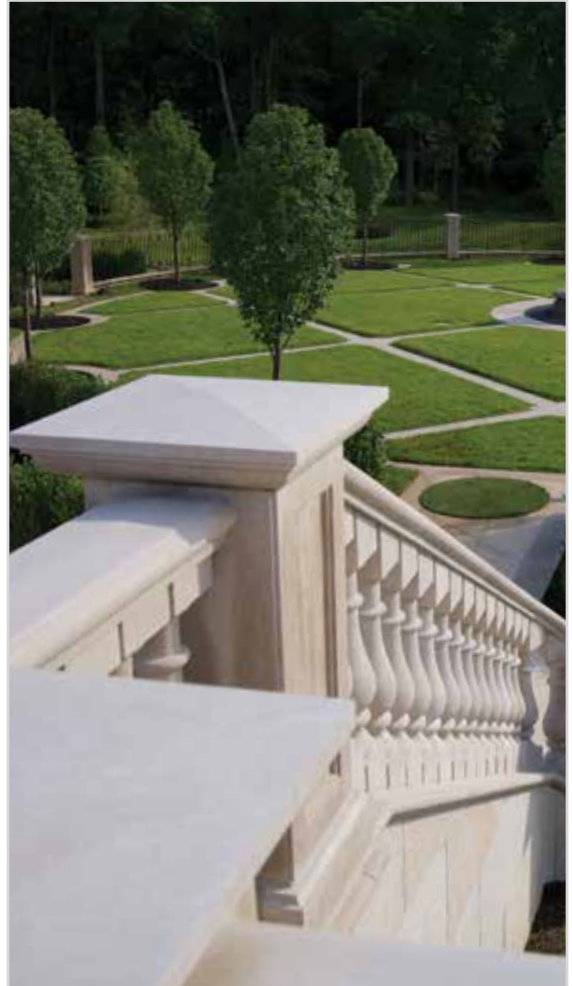
Custom pier caps and wall caps.