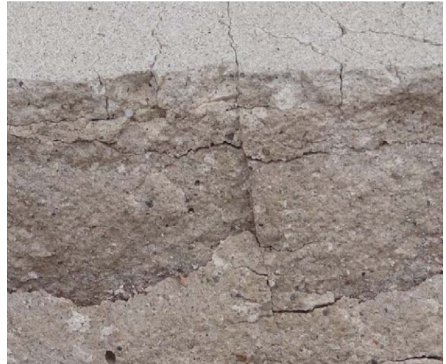
The above illustrates cracking which is probably the most common problem associated with cast stone

Cast stone can be reinforced with steel to help reduce cracking, 4 but the introduction of reinforcing steel also presents an issue. Cast stone is a permeable product, allowing water to pass through it. If water makes contact with the steel, it will rust and expand. This causes the product to crack and split, compounding the very problem the steel was meant to prevent. 4