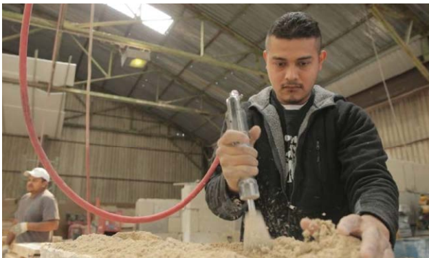
Vibratory dry tamping (VDT) Casting

Cast stone is a cementitious product made from fine and coarse aggregates, Portland cement (a combination of calcium, silicon, aluminum, iron, and other ingredients), 3 sand, mineral oxide color pigments, chemical admixtures, and water. Two processes are typically used to produce cast stone: the vibratory dry tamping (VDT) method and wet casting.