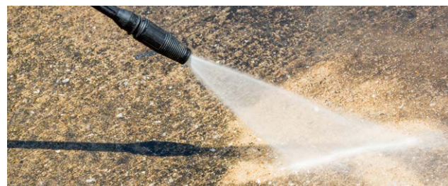
The above illustrates soiling which is caused by exposure to pollution, soot, and dust.

those used for granite, may be used. 2 If the composition of the product or manufacturer is unknown, the Cast Stone Institute recommends using a mild detergent and water and to avoid power washing, sandblasting, or metal brushes. 7 Additionally, unusual stains can be handled in the same manner as cleaning traditional concrete, taking care not to scar the surface with abrasive chemicals or brushes.