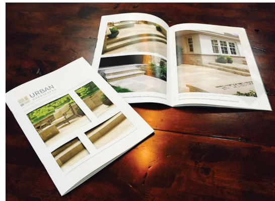
Urban Hardscapes Brochure