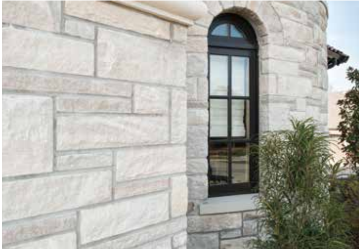
Create a contemporary look with a bonded pattern