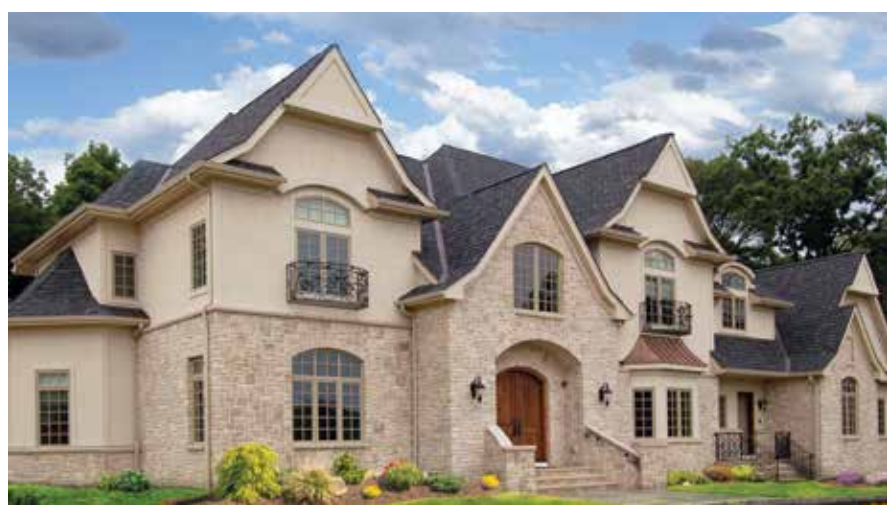
{\it Consider mixing the split and tumbled look of Rockford to contrast smoother building materials}